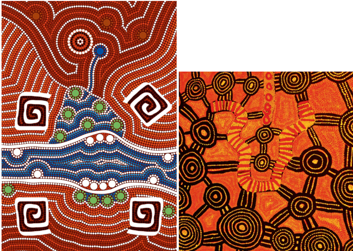
Aboriginal painting from Tiwi Islands near Darwin and The wet season

Discover 2 exercises before reading stories